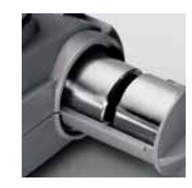
Calibration weights in drawer