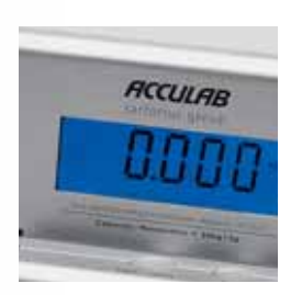
Flexible, backlit graphical display