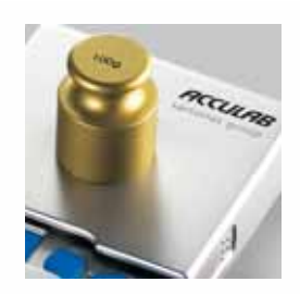
Calibration weight included

The POCKET-PRO series has been developed for portability, making these balances perfect for use in motion and on the road – especially when little space is available for complex equipment. POCKET-PRO equipment features 0.1 g and 0.01 g readability, ideal for sample preparation, test kits and special applications. The backlit, graphical display can be read even under poor lighting conditions and is unique in its class.