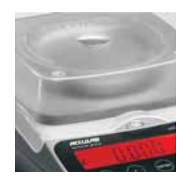
Closed dust cover

The balances in the VICON series from ACCULAB are distinguished by their excellent value for money and an ingenious design, with many practical details. The VICON series offers resolutions up to 1 milligram and weighing capacities up to 10 kg, making it ideal for use in laboratories, education, training and in industry, as well as for special applications in many areas. All models have a flip-up cover for safe transportation and can be easily stacked without slipping.