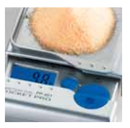
Weighing pan attachment for loose sample material